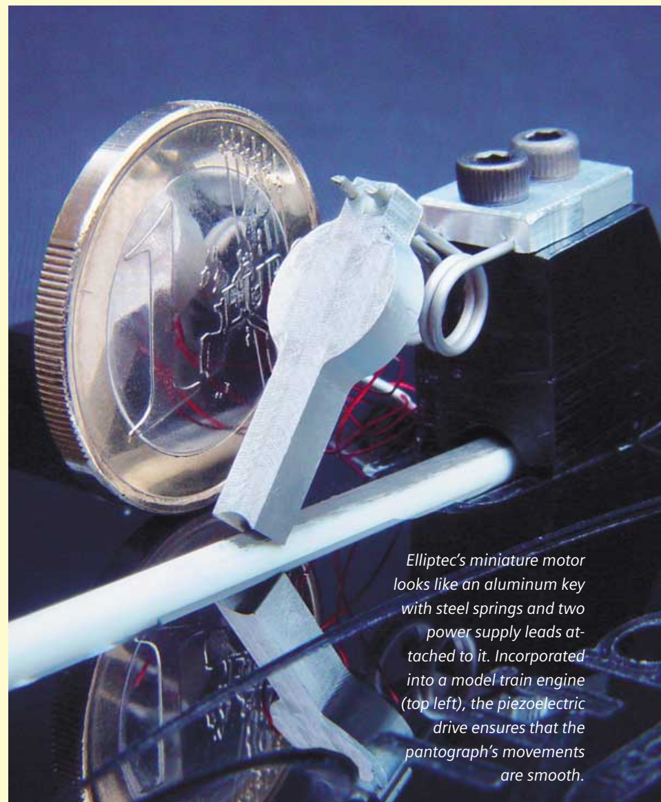
Ellipectec's miniature motor looks like an aluminum key with steel springs and two power supply leads attached to it. Incorporated into a model train engine (top left), the piezoelectric drive ensures that the pantograph's movements are smooth.

But the miniature drive system from Ellipectec is ideal for far more than just model railways and the wiggling ears of animated bears, dolls and plastic puppies. The company expects the device to perform its preci-